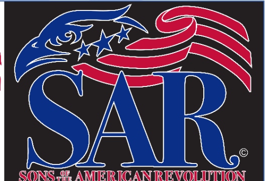
3. To be used on dark backgrounds

All of the new logos have the copyright symbol on them and these are the only logos approved for use. They are available by e-mailing Don Shaw and requesting the link to the downloads. Be sure to inform Don what you will be using the logos for. Please do not use any other logos than the three above.