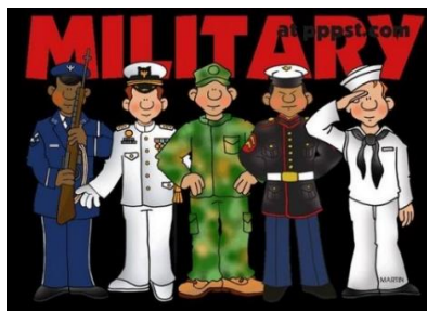
Military Humor highlights is from the Facebook group by the same name