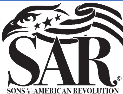
1. Black & White

There are three separate logos available for download. They are a Black & White, a Color Logo (as shown on the SAR magazine), and a logo that can be used on dark backgrounds.